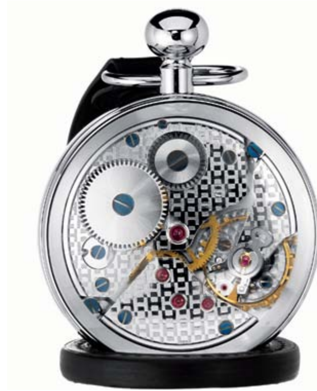
[ Watch Pendulette Boule Hermès ]