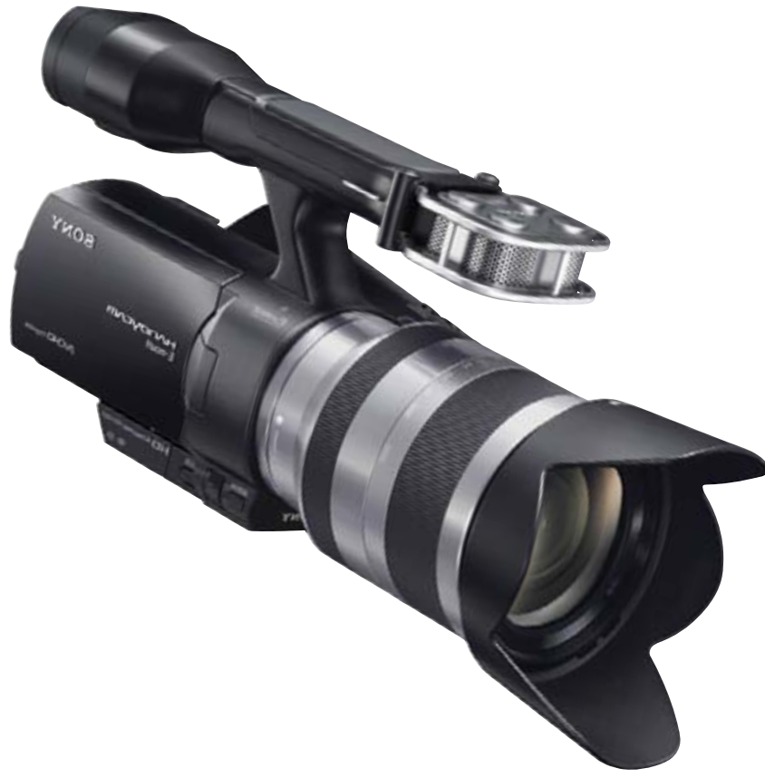
[ Camera Sony ]