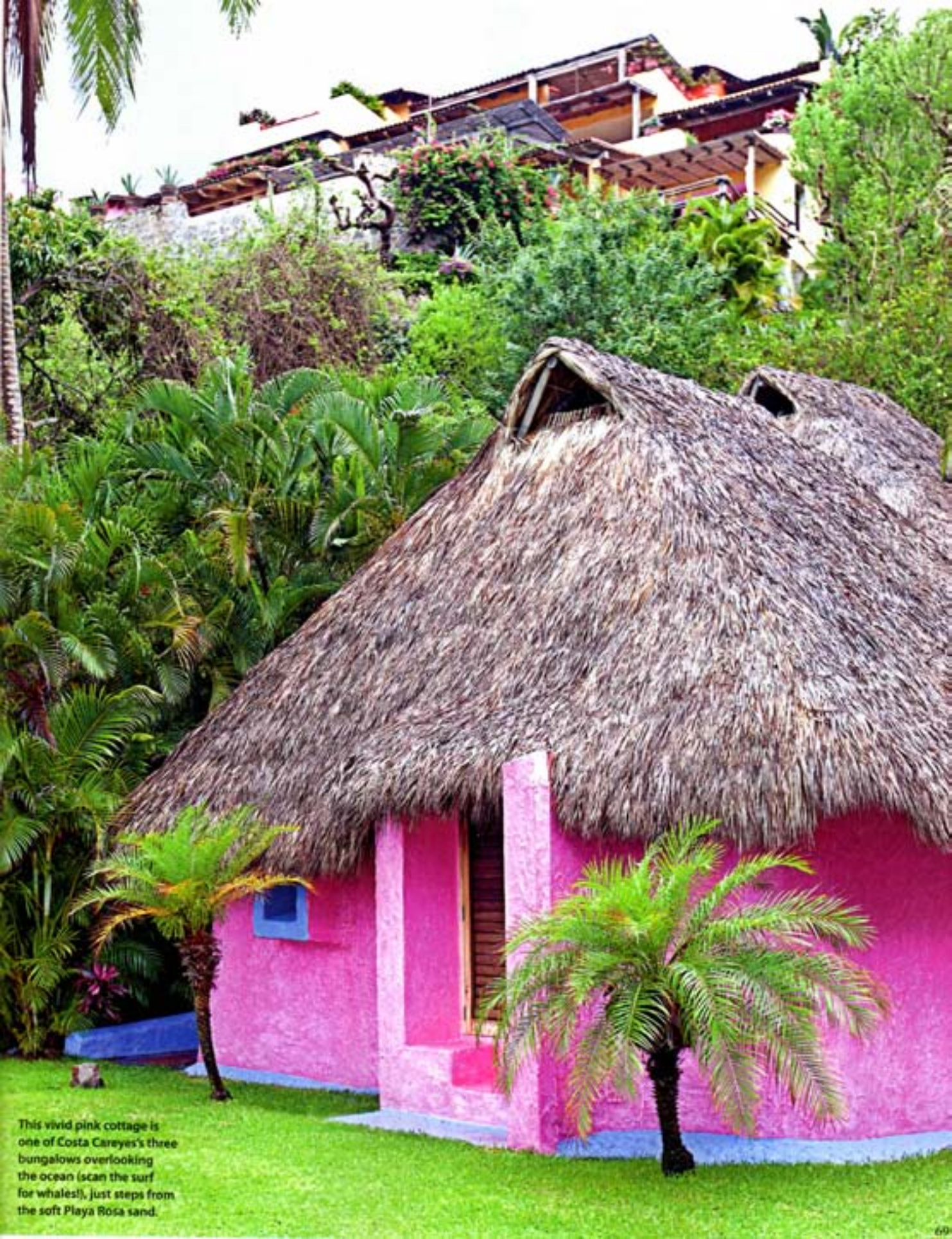
This vivid pink cottage is one of Costa Carey's three bungalows overlooking the ocean (scan the surf for whales!), just steps from the soft Playa Rosa sand.