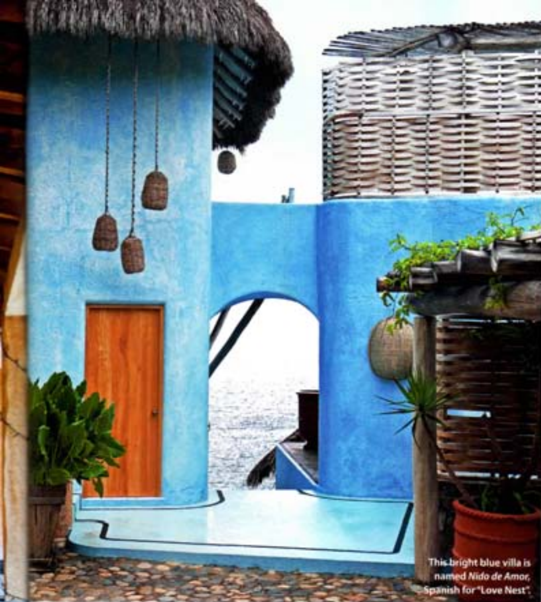
This bright blue villa is named Nido de Amor , Spanish for "Love Nest".